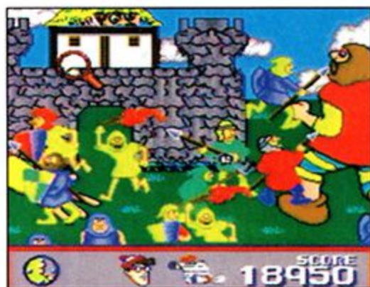
Land of the Gargantuas

If you have chosen either the Normal or Expert difficulty level, you can choose which of the 4 areas to begin your search. The areas are: