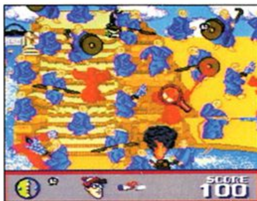
Water Monks vs. Fire Druids