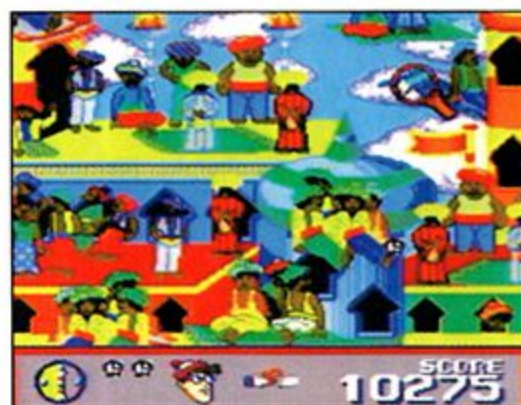
Kingdom of the Carpet Flyers