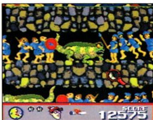
The Enchanted Underground

You can choose any of them in any order you wish by using the control pad to move left or right and then pressing the A Button when the picture from the realm you wish to visit appears in Whitebeard's crystal ball. The clock starts running when you arrive at each level, so search quickly!